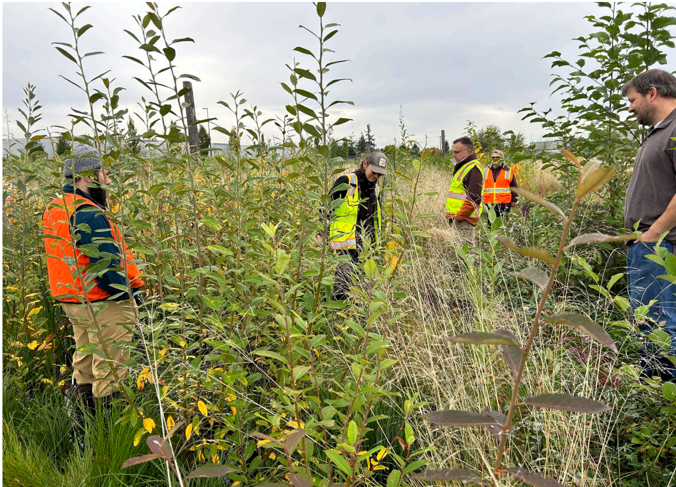
Lower Wapato Year 0 Site Visit