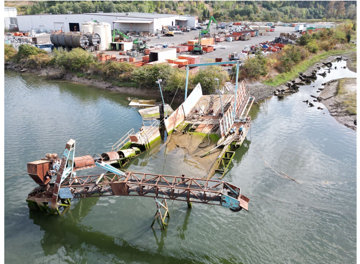
Derelict barge removal