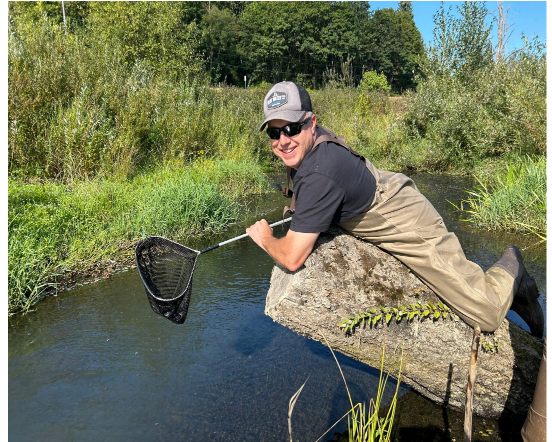
Battling invasive Bull Frog tadpoles