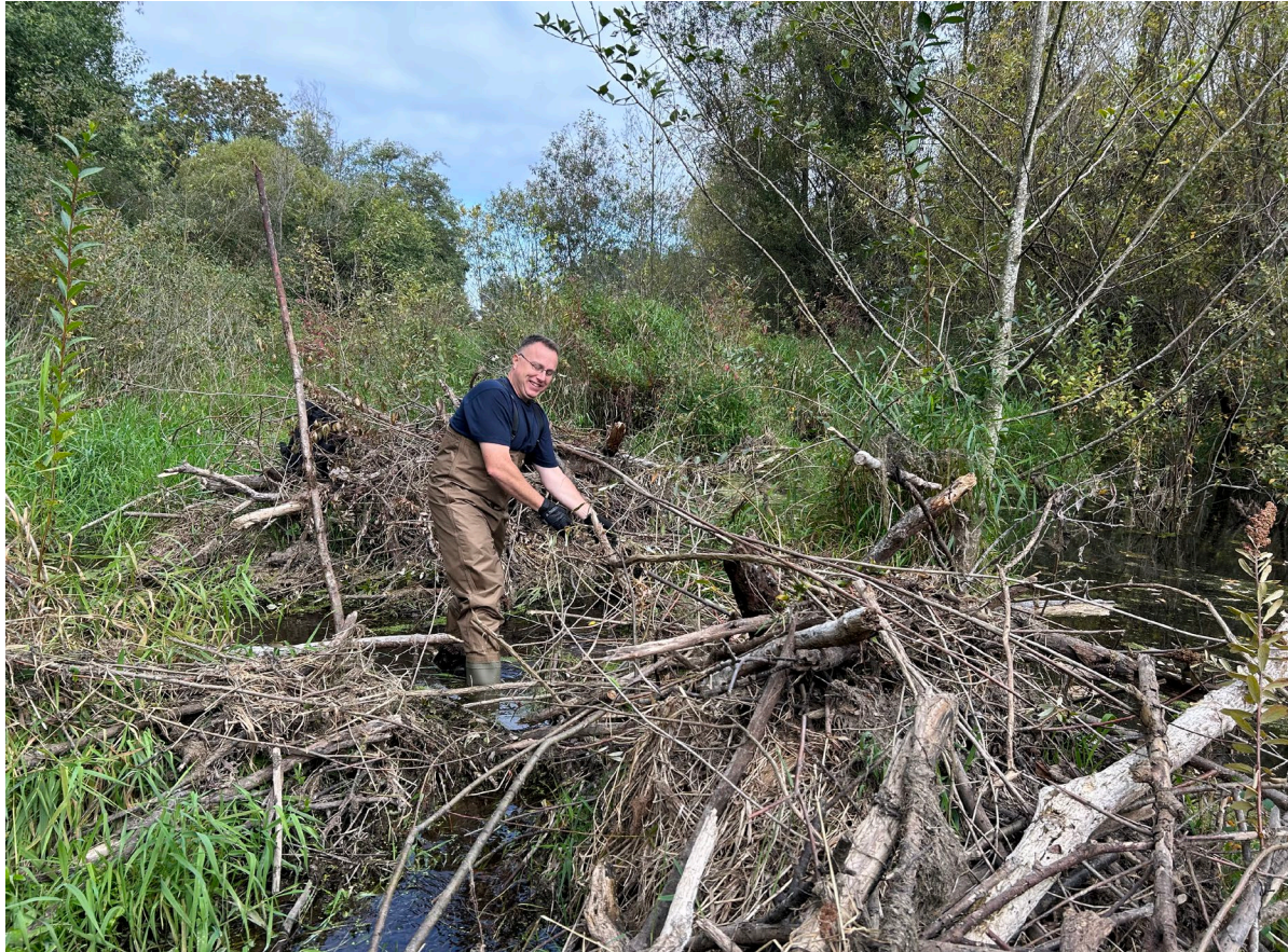
Beavers are Relentless!