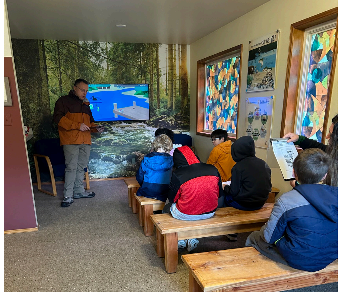
4 th graders at Puyallup Historical Hatchery