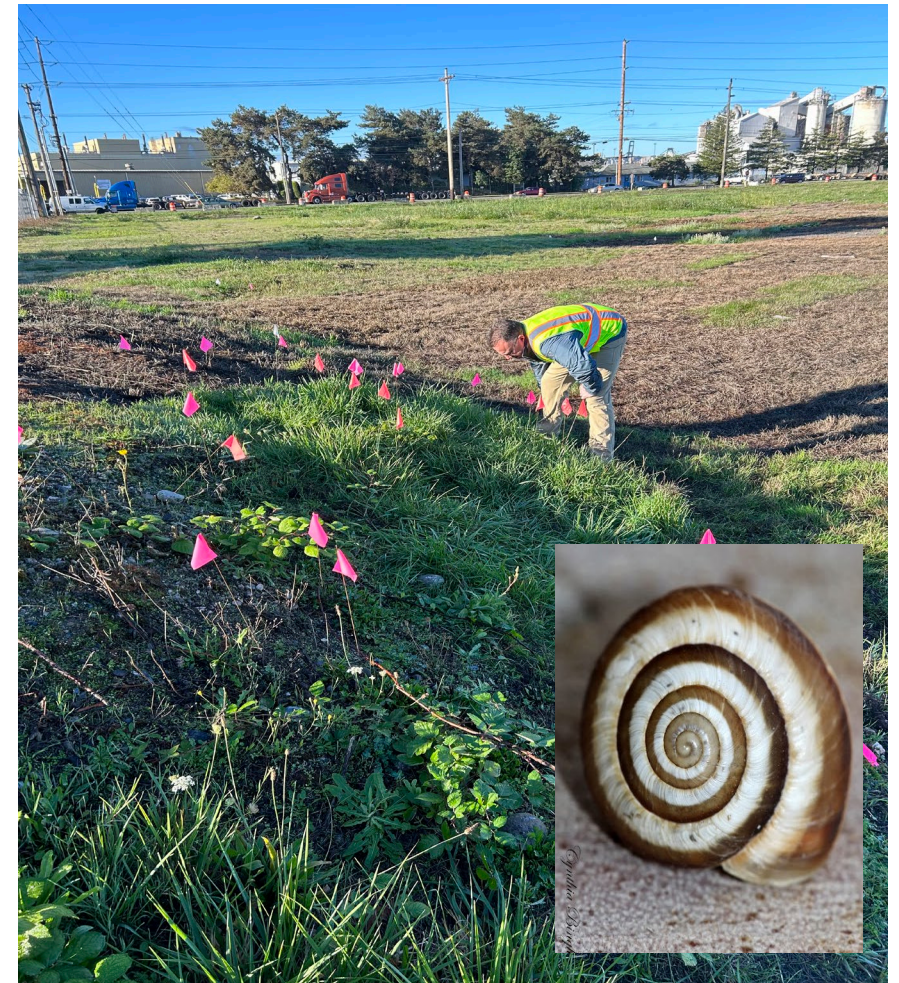
Hunting Vineyard Snails